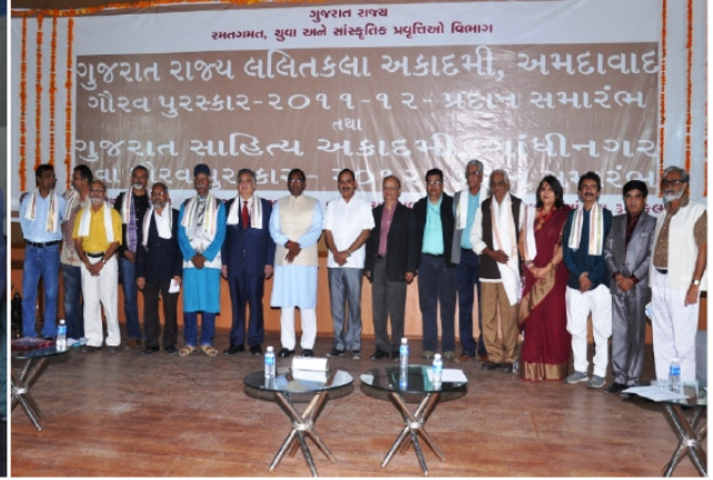
All Gaurav Puraskar recipients during the occasion